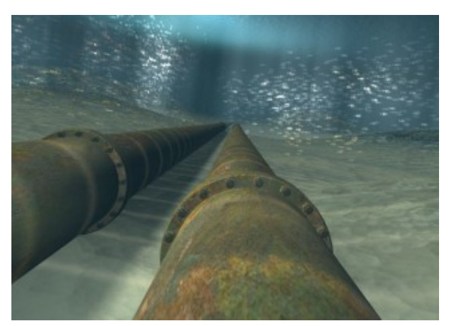
Corroded subsea pipeline (<u>http://subseaworldnews.com/2014/04/01/baosteel-yantai-delivers-subsea-steel-pipes-for-bohai-oilfield/</u>)

Your company is tasked with repairing a section of corroded pipeline. This includes turning a valve to stop the flow of oil, removing the corroded section of pipeline, installing a new section of pipeline, and turning a valve to restart the flow of oil.