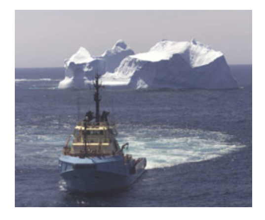
The FPSO Terra Nova (www.suncor.com/en/about/4001.aspx)

Suncor Energy is currently looking for ROVs that can perform routine maintenance and repair. Engineers and offshore personnel will evaluate the ROV's performance in the OCRE's offshore engineering basin as well as MI's flume tank. These facilities will allow the company to determine how the ROV handles working in the extreme environment of the North Atlantic.