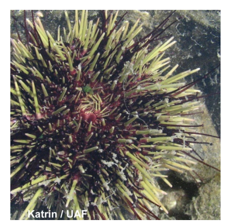
Urchins on the Arctic seafloor (<u>www.arcodiv.org/seabottom/Urchins.html</u>)

Your company is also tasked with deploying a passive acoustic sensor on the seafloor underneath the ice sheet to monitor baleen whales. These sensors are essentially underwater hydrophones that "listen" for the whale calls.