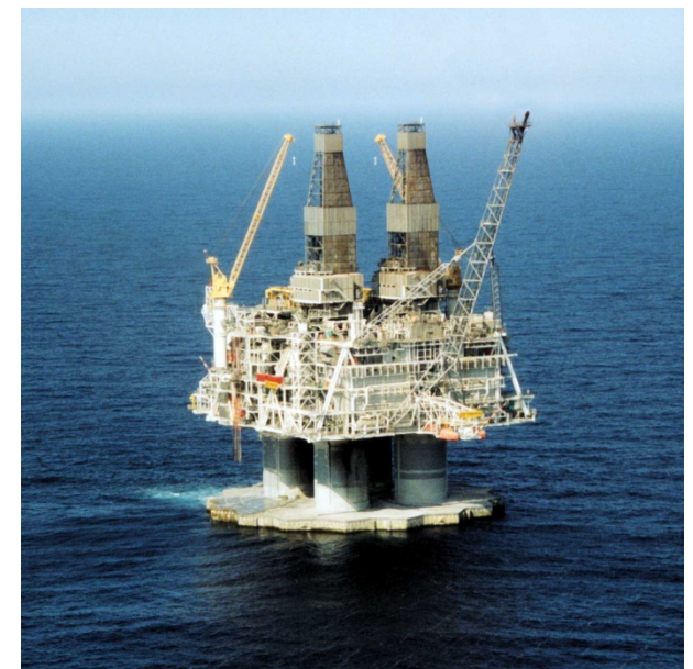
The Hibernia oil production platform, one of four oil platforms located off the coast of Newfoundland (<u>www.hibernia.ca</u>)

production (total world oil production is ~89.7 mbls/day). Currently there are three countries with oil-producing platforms in the North Atlantic – the United Kingdom, Norway, and Canada.