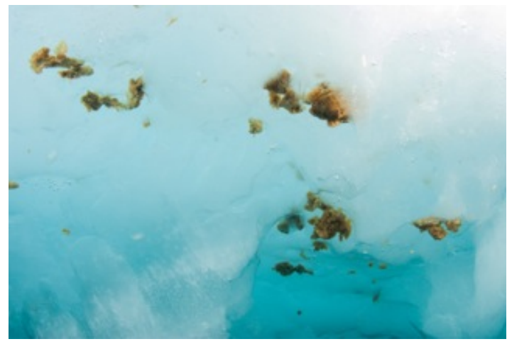
Algal "lumps" under Arctic Sea ice (<u>www.arctic.noaa.gov/reportcard/sea_ice_biota.html</u>)

Your company is tasked with collecting urchins from the seafloor and samples of algae from the underside of the ice sheet.