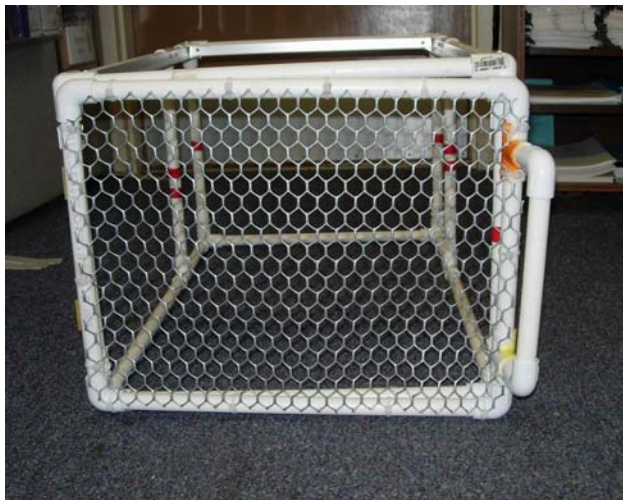
Figure 4: Trawl-resistant frame, front view of door and top view.

Once the electronics module is inserted into the frame, teams will need to open the door on the front to access the ports. The door is made from ½-inch PVC. The door is hinged on the left side (when facing the frame from the front) with the handle on the right side. The door is covered in ¾-inch hexagonal mesh. This mesh will help to decrease water resistance when the door is opened. If the electronics module is inserted properly, both ports should be accessible when the door is opened.