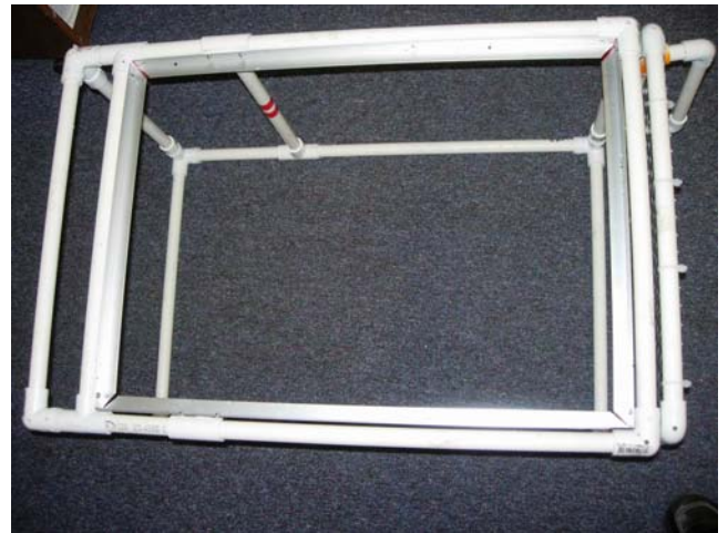
Figure 5: Trawl-resistant frame, view of angle aluminum guide rail.