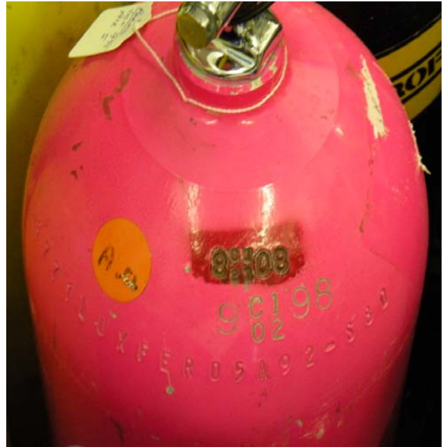
Figure 3: Hydro Inspection

The yellow tank on the left was last hydro-inspected on May 5 th , 2006. It expires on May 1 st , 2011. The pink tank on the right was last hydro-inspected on August 8 th , 2008. It expires on August 1 st , 2013.