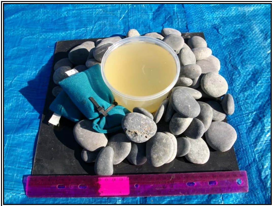
Figure #4: Agar on rocky outcropping with ruler