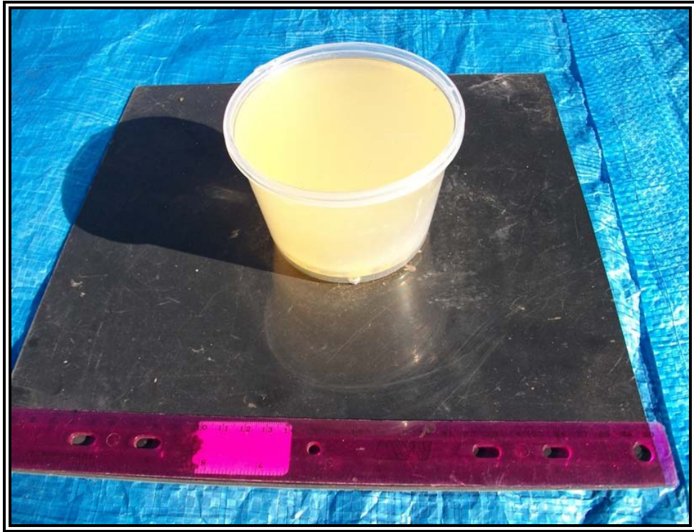
Figure #3: Agar container in holding container