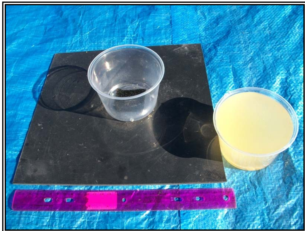
Figure #2: Holding container attached to 31cm by 31cm base plate and agar container