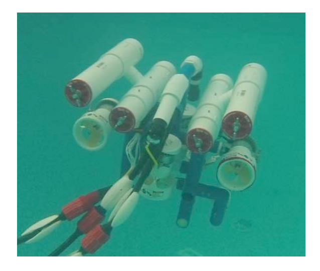
Figure 7: The backside of the FDS 2016 showing the four top ballast tubes that keep the vehicle stable underwater. (L. Potter).

FDS-2016 incorporates four 2" ballast tubes for buoyancy and structural support. The ballasts are joined to the mainframe by 2" to 3/4" tees. 2" PVC end caps are glued onto one end of each ballast and 2" removable test plugs cap in the other ends. The 2" test plugs are used so that ballast can be adjusted for varying conditions. The test plugs have an expandable seal with a wingnut that can be easily removed. The ballast is incorporated into the frame structure to strengthen the design as well as provide protection for the thrusters which are nestled within their diameter. (see Figure 7 below).