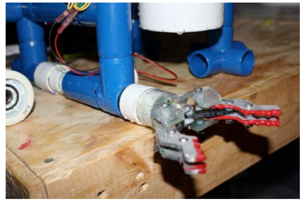
Figure 5: The Manipulator in horizontal configuration