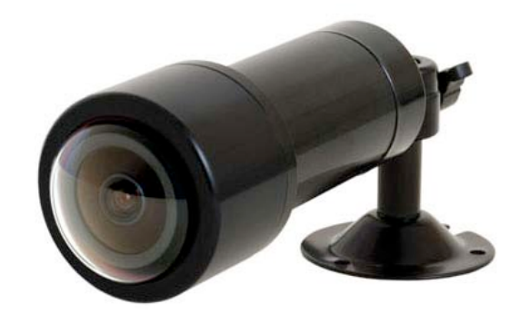
Figure 8: The wide-angle camera