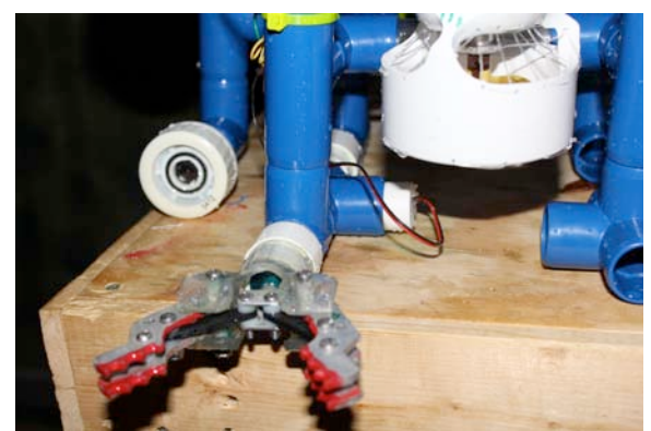
Figure 4: The Manipulator's fingers, with red tips

Our manipulator consists of one linear actuator housed in a length of \frac{3}{4} " clear PVC enclosed with rubber grommets, PVC bushings, and PVC tees. We coated the moving parts and the actuator's shaft in marine grease to prevent water intrusion. The linear actuator drives the opening and closing action of the fingers. The fingers are cut from aluminum stock to maximize durability while minimizing weight and bulk, and their tips are painted red to promote safety around the potential hazard they pose. The manipulator arm includes a high torque DC planetary gear motor which provides for 360 degree clockwise and counterclockwise rotation of the manipulator assembly. (Figure 4). The DC gear motor is only 1.9 cm in diameter while still providing high torque output. This allows the motor to be housed and waterproofed within <sup>3</sup>/<sub>4</sub>" PVC fittings and mating with the ROV frame. A PVC Slip-T allows the manipulator to rotate freely. (see Figure 5).