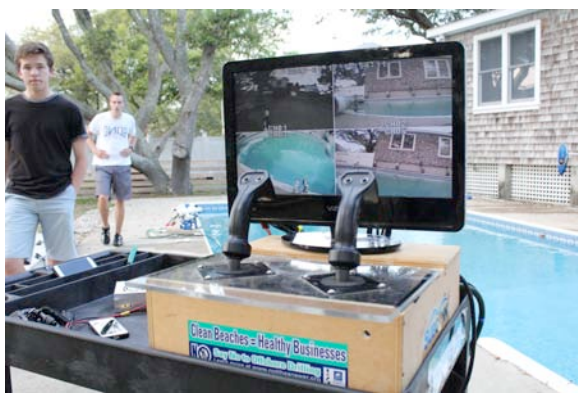
Figure 12: The control box with joysticks

The camera quad splitter is also located in the control box. It processes the four camera inputs and outputs to a standard 22" flatscreen TV that sits atop the control box for easy viewing. (Figure 12).