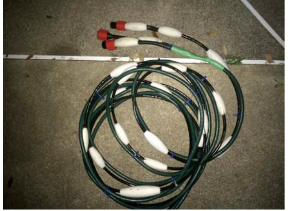
Figure 9: Tether consisting of two cables and gill net floats. (L. Potter)