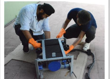
Fig 3: Company members take safety precautions before handling the ROV