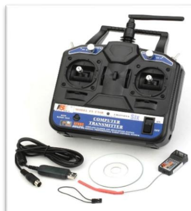
Fig 4: RC controller and reveiver is used for piloting