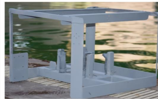
Fig 1: The edges of the chassis are smooth and lightweight