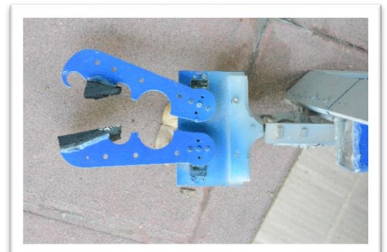
Fig 6: Mansarover makes use of a multipurpose mechanical arm designed in-house