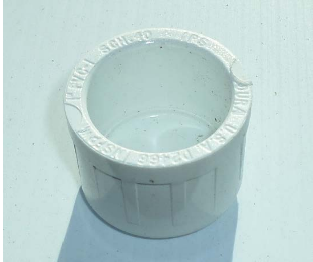
EXPLORER product demonstration build photo #12: 1-inch end cap holder for fountain.