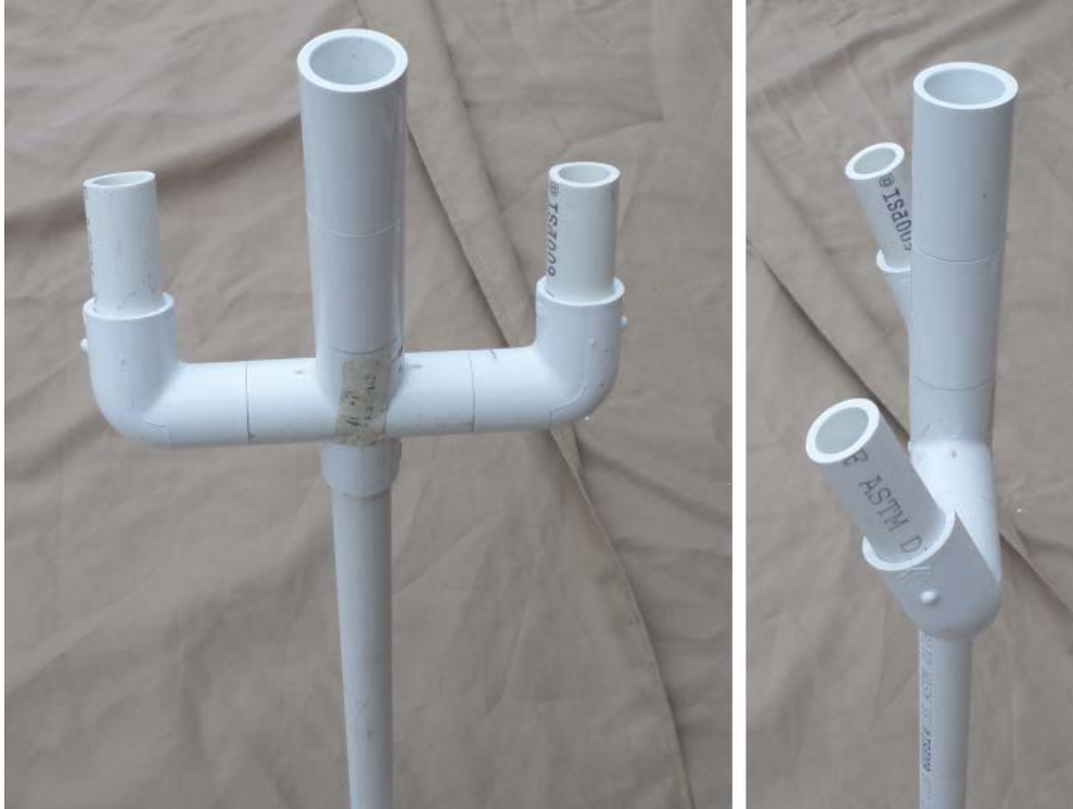
EXPLORER product demonstration build photo #3: Locking mechanism internal, front and side view.