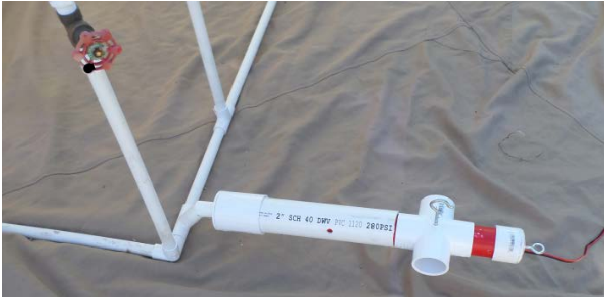
EXPLORER product demonstration photo #1: The power cable connected to the platform.