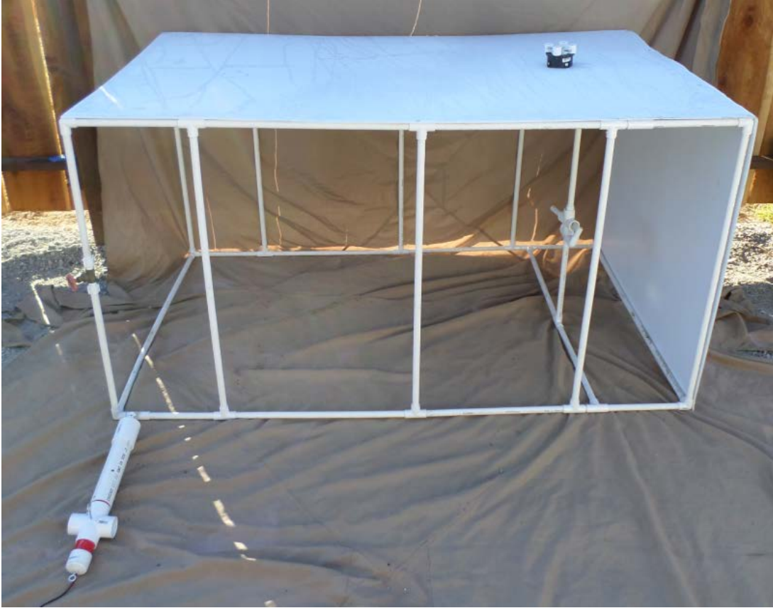
EXPLORER product demonstration photo #3: The platform.