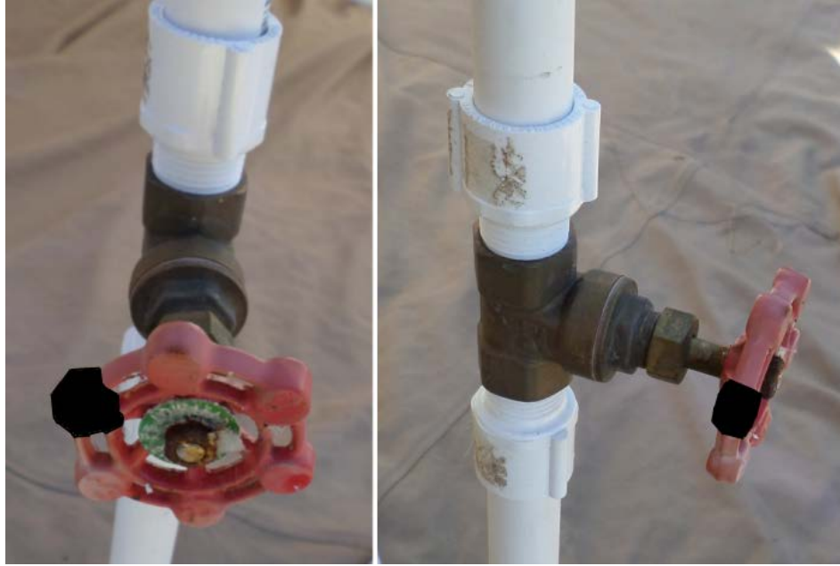
EXPLORER product demonstration build photo #9: The valve.