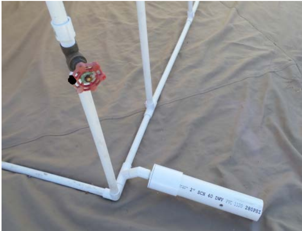
EXPLORER product demonstration build photo #10: The valve attached to the framework.