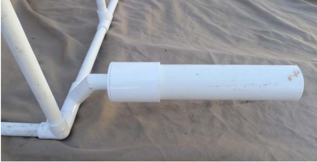
EXPLORER product demonstration build photo #8: The power port attached to the platform.