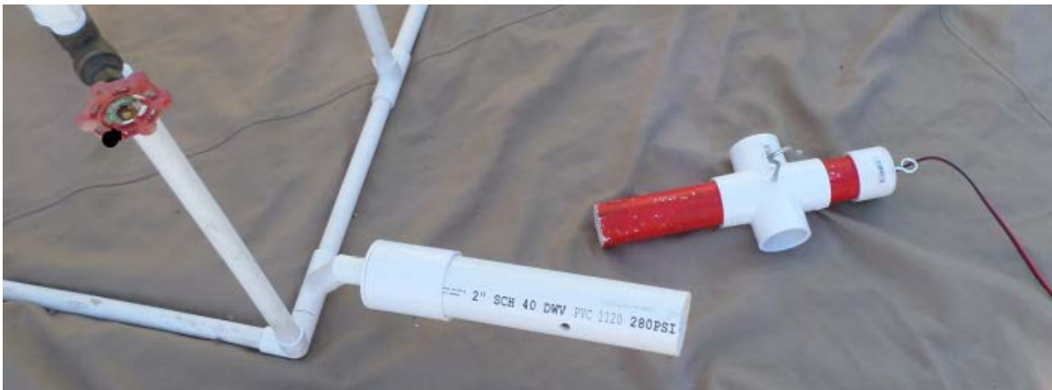
EXPLORER product demonstration photo #2: The power cable disconnected to the platform.