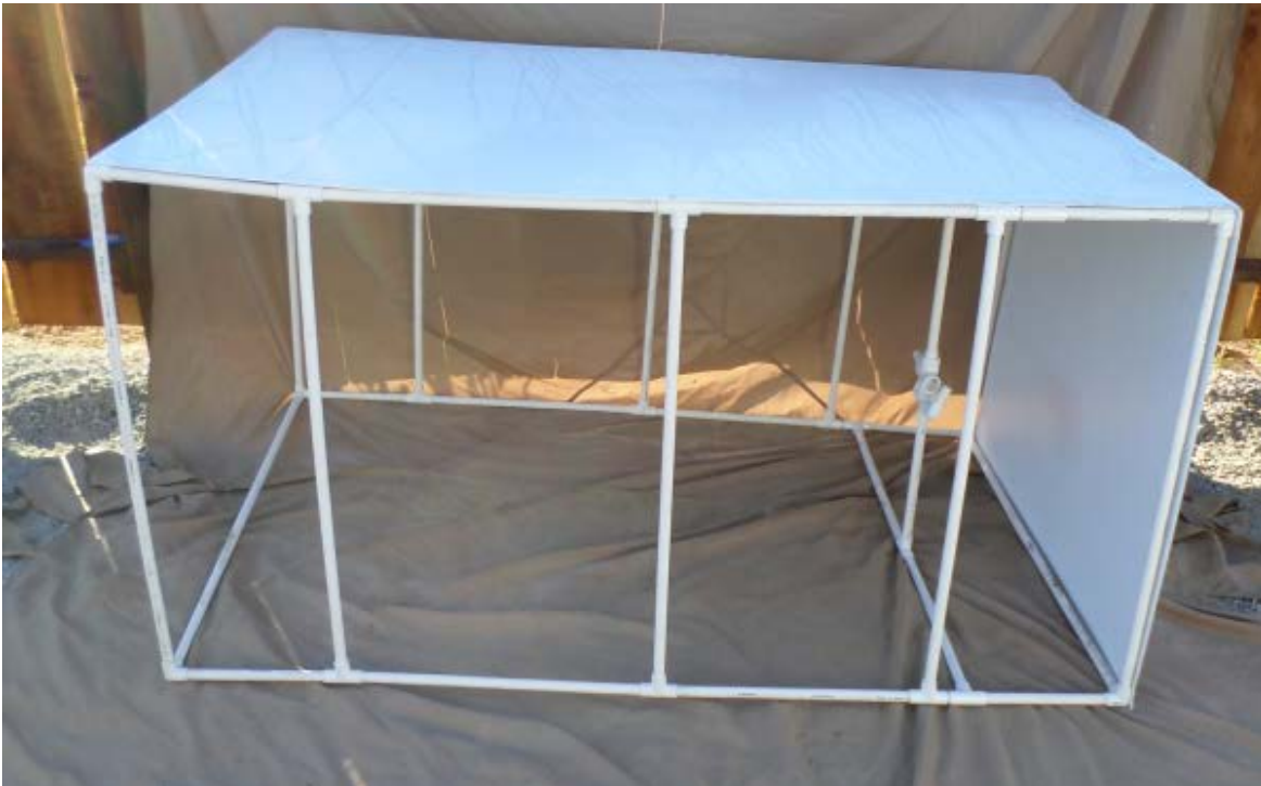
EXPLORER product demonstration build photo #5: Platform.

The framework should be approximately 2 meters long, 1.2 meters wide, and 1 meter tall. Cut a 2 meter by 1.2 meter rectangle of corrugated plastic sheeting. Use screws to attach this sheeting onto the top side of the platform framework. Cut a 1.2 meter by 1 meter rectangle of corrugated plastic sheeting. Use screws to attach this sheeting onto the back wall of the platform, the side closest to the locking mechanism.