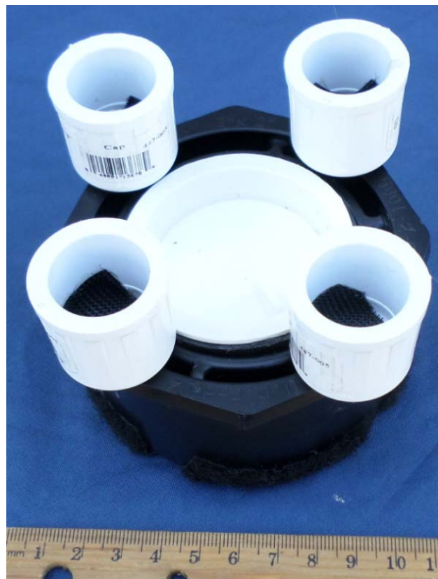
EXPLORER product demonstration build photo #11: The fountain.