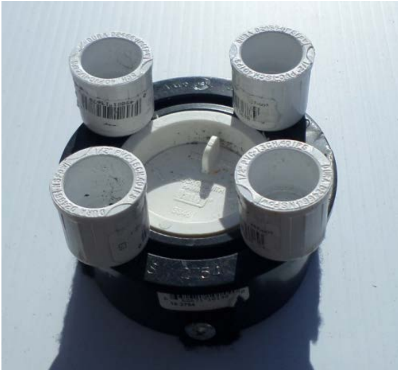
EXPLORER product demonstration build photo #13: The fountain on the platform.