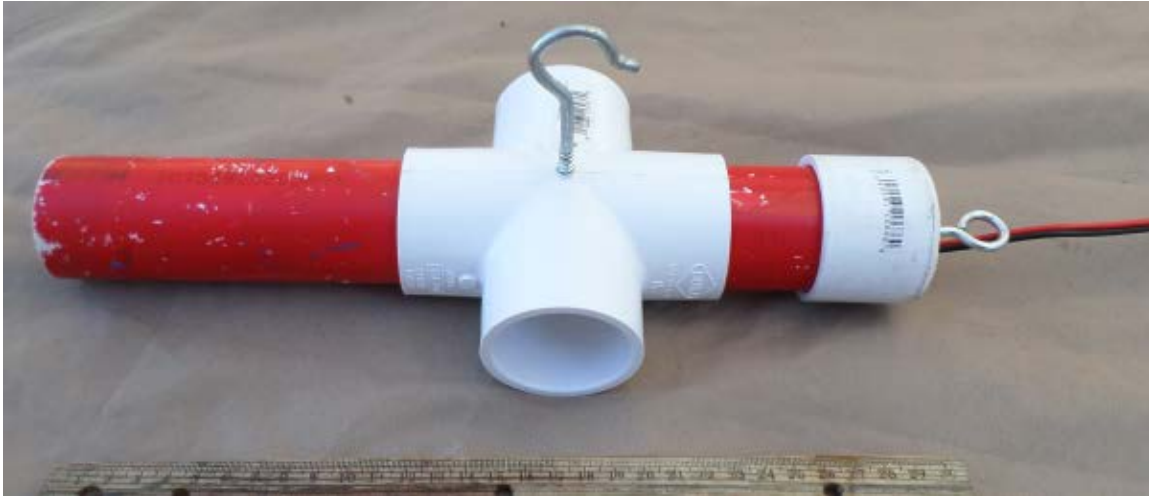
EXPLORER product demonstration build photo #6: The power cable connector.

Design note: The EXPLORER power cable connector is the 2016 ESP cable connector. The 8 meters of rope has been replaced with 2 meters of wire.