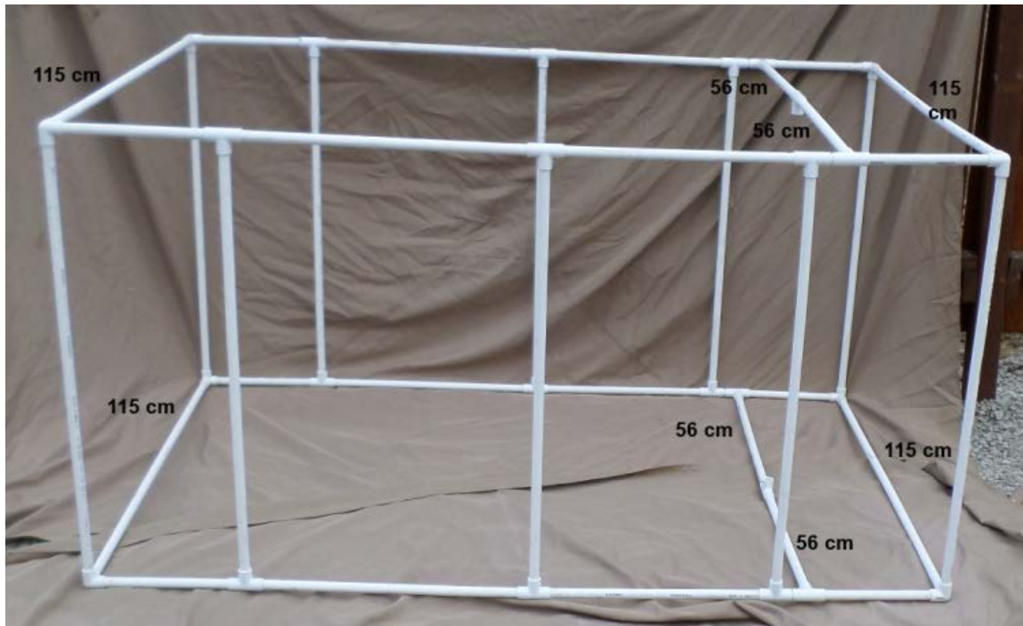
EXPLORER product demonstration build photo #2: Framework of the platform.