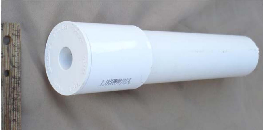
EXPLORER product demonstration build photo #7: The power port.

Attach the port to the bottom corner of the platform, into the 30 cm length of PVC pipe. To attach the port: