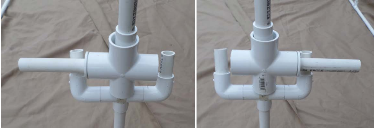
EXPLORER product demonstration build photo #4: Locking mechanism; locked and unlocked.