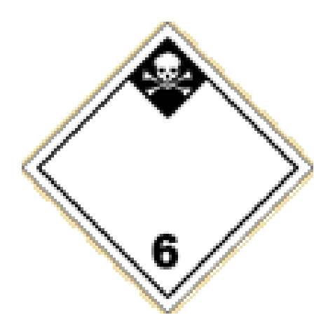
Hazard Class 6